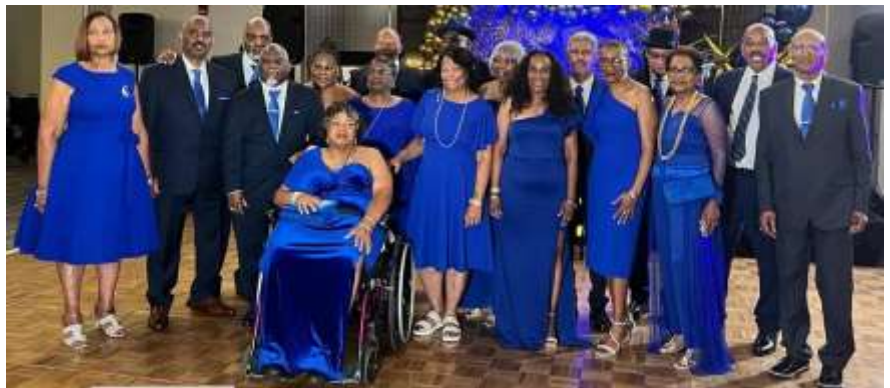
Class of 1973 Rainbow City High School