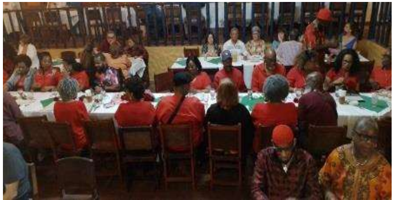
Show Tipico Panameño por el Restaurante Las Tinajas