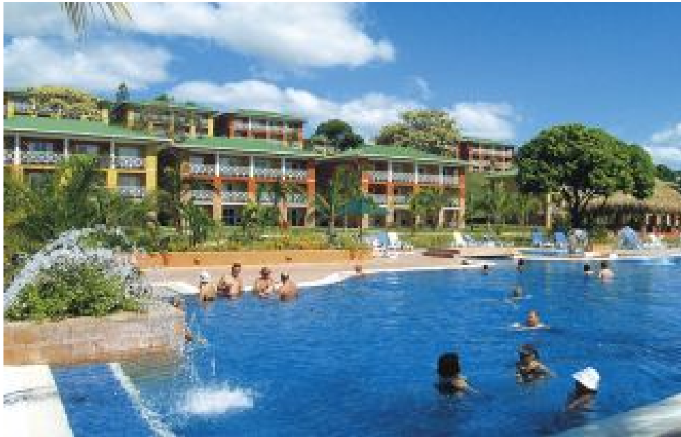
Decameron Beach Resort

2:00 p.m. Two (45-passenger) buses departed from Hotel Torres de Alba for Decameron Beach Resort, where we spent three enjoyable days and two delightful nights enjoying the facilities. Number of persons who went to Decameron: 78