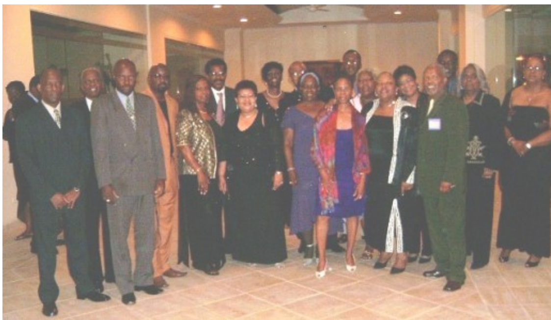
Members of the Class of 1968 say “ Hasta pronto. ”