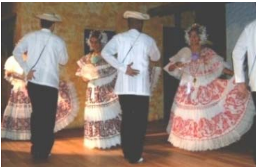
Folkloric dances by Panamá Ritmos y Tambores at Tinajas Restaurant.