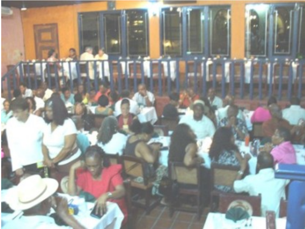
Following supper at Tinajas Restaurant we were treated to a typical Panamanian show by the Folkloric Group Panamá, Ritmos y Tambores. Number of persons attending supper at Tinajas: 86