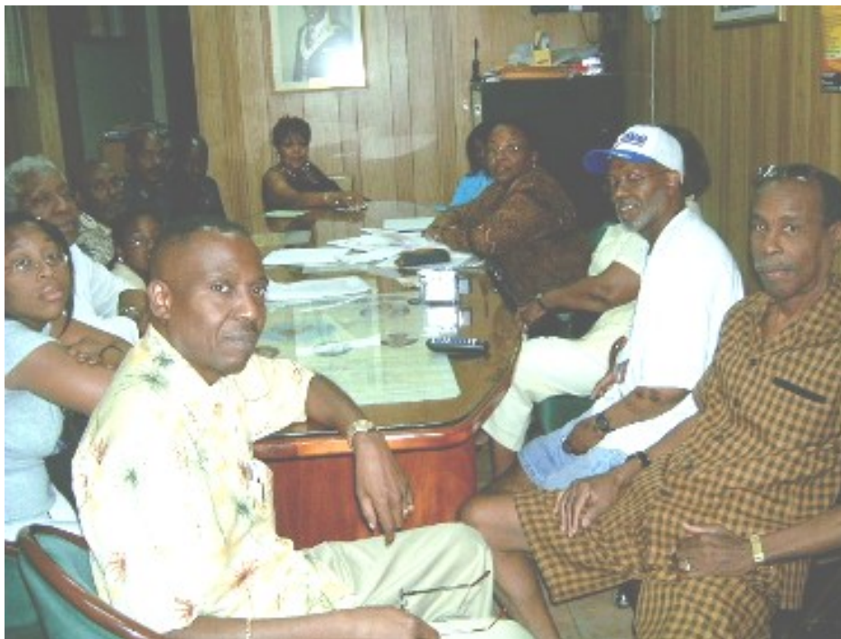
A partial view of attendees at our closing meeting.

7:30 p.m. Following our meeting, an informal get-together was held at the Elks Hall. Number of persons attending:75.